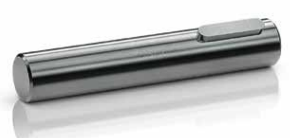
Intermediate shaft with one key