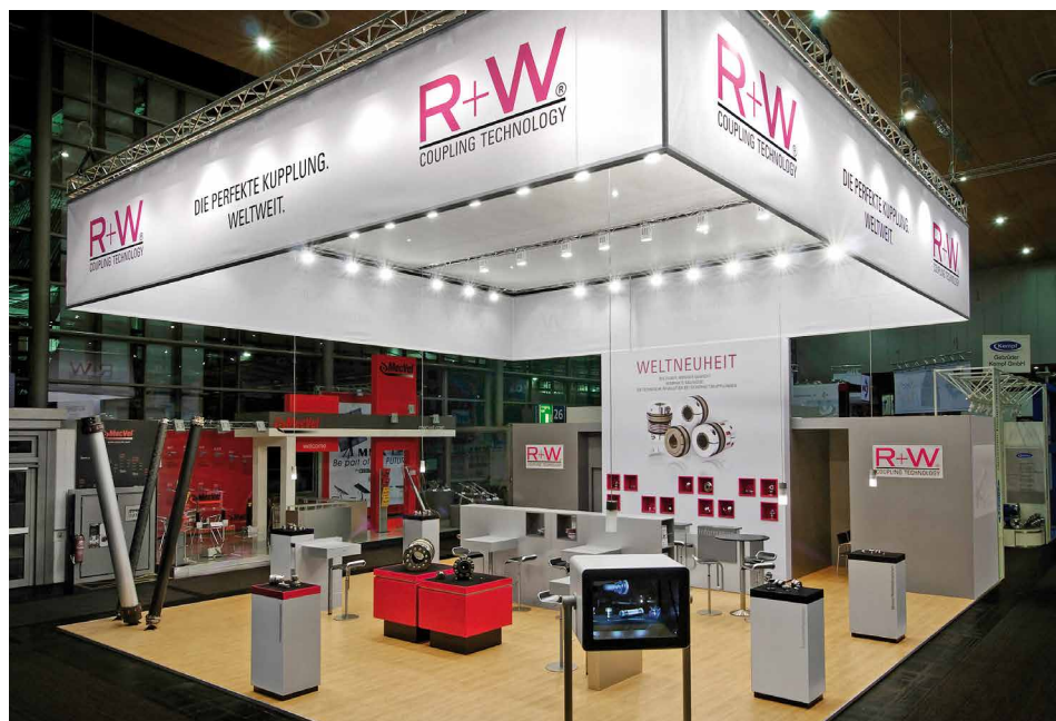
Hannover Messe 2011

Presence at various trade shows is a basic requirement that enables R+W to stay close to the client industries. Exhibitions offer the company opportunities to showcase innovations, while taking on industry trends that will impact on the future products.